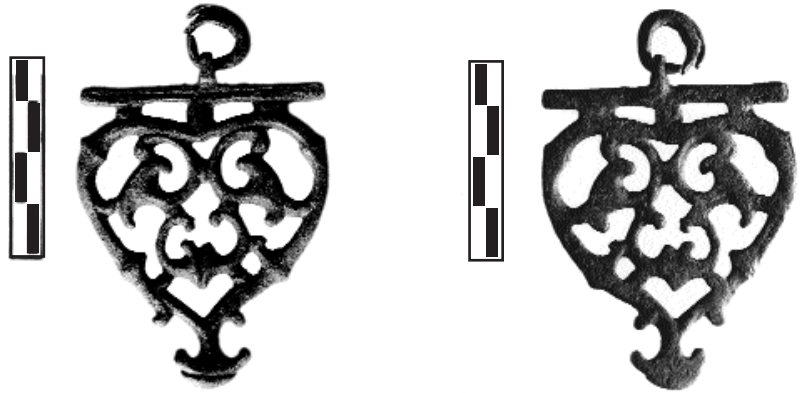
Figs. 2-3. Bronze pendant. Chance find near the village of Mikhailovka, Eastern Crimea. G.A. Asliyan Collection, Moscow. Scale as indicated.

(1992, 86) has mentioned, open-worked pendants with revived Celtic motifs, including the so-called Trompetenmotiv , were widespread in the late 2nd-3rd centuries AD. With similar pendants also sword girdles were decorated (Bishop/Coulston 1989, 51-3).