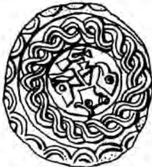
(e) Eskiypar (Dinçol 1988)