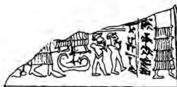
(b) Matouš 1984: no. 119