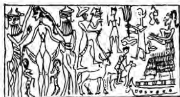
(a) Matouš 1984: no. 83

The five Indo-European roots serving as a startingpoint for the