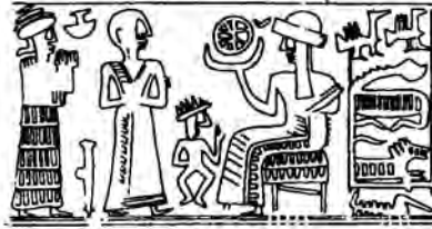
(b) Kültepe/Kanesh (Garelli & Collon 1975: pl. 48, no. 2)