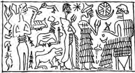
(a) Kültepe/Kanesh (Matouš 1984: no. 73)