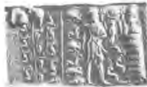
(f) Klavdia, Cyprus (Collon 1987: no. 202)