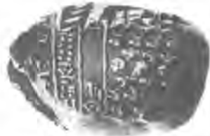
(c) Achemhöyük (Özgülç 1980: Fig. III, 17)