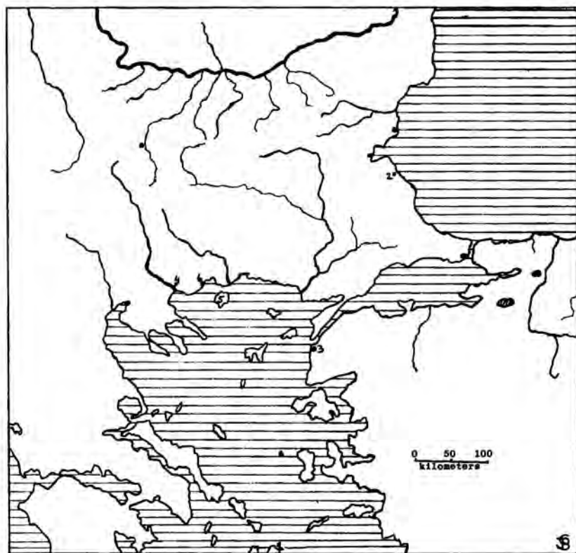
Fig. 5. Thrace and the Aegean: location of sites mentioned in the text. 1. Naxos; 2. Apollonia Pontica (modern Sozopol); 3. Troy; 4. Serrhai (modern Siris); 5. Thasos; 6. Antisara (modern Kalamitsa).