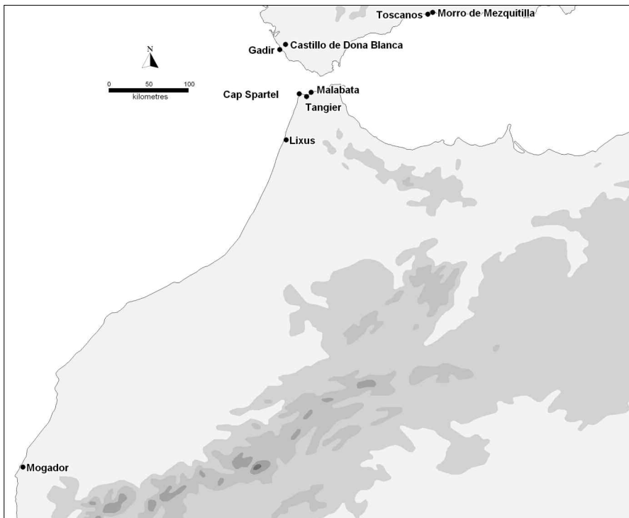
Fig.1. Sites with Phoenician material in Morocco (Map produced using Collins Bartholomew Ltd digital map data (c), www.collinsbartholomew.com reproduced with permission).

Crucial to the interpretation of these sites is the distinguishing of Phoenician ex-nihilo establishments of a permanent or seasonal nature from indigenous settlements with Phoenician imports. The settlement at Kach Kouch, for example, located on a headland overlooking the valley of Lau, near the Straits (Bokbot/Onrubia-Pintado 1995) is a case in point. Hypotheses oscillate between suggestions of an indigenous and a Phoenician settlement 4 .