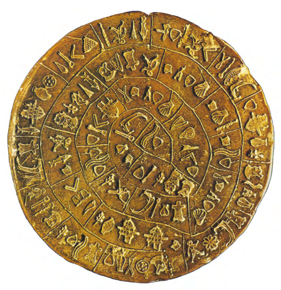
Fig. 1b. The disc of Phaistos, side B.