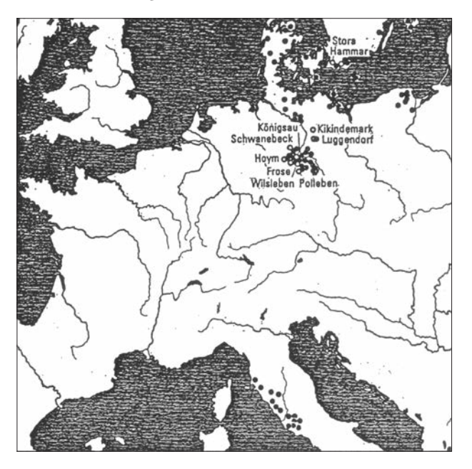
Fig. 2. Distribution of house urns (from Bouzek 1997, fig. 49).

Fig. 1. Distribution of biconical urns in the urnfield world (from Hencken 1968, fig. 452).