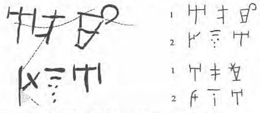
Fig. 1. KN Zb 40 from the Minoan Unexplored Mansion

There are two Linear A inscriptions that may date from the LM II period, and in view of their possible date in what is otherwise an epigraphic lacuna between the latest stage of Linear A (LM IB) and the earliest of Linear B (LM IIIA1) they deserve close attention. These two inscriptions are both from Knossos, one on a pithoid jar from the so called Minoan Unexplored Mansion; and the other on the doorway of the Kephala Tholos Tomb, 15 minutes walk north of the Palace of Minos.